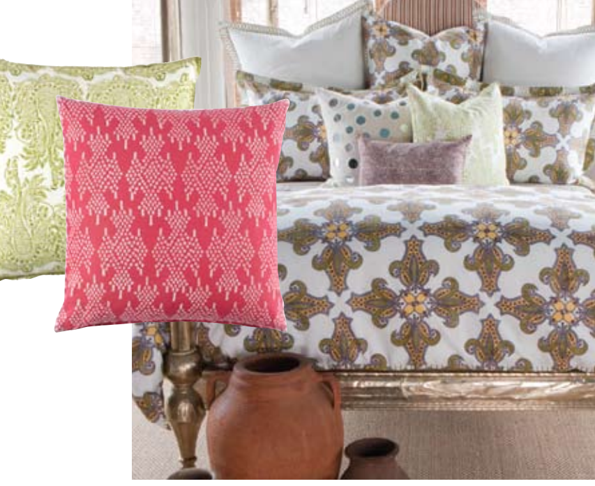
Block print patterns inspired by exotic countries abroad puts us in that spring frame of mind. The bright tones combined with flowing and vivid patterns are reminiscent of exotic places with warm climates.