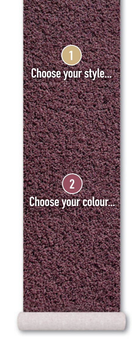
Carpet tile from Flor (flor.com)