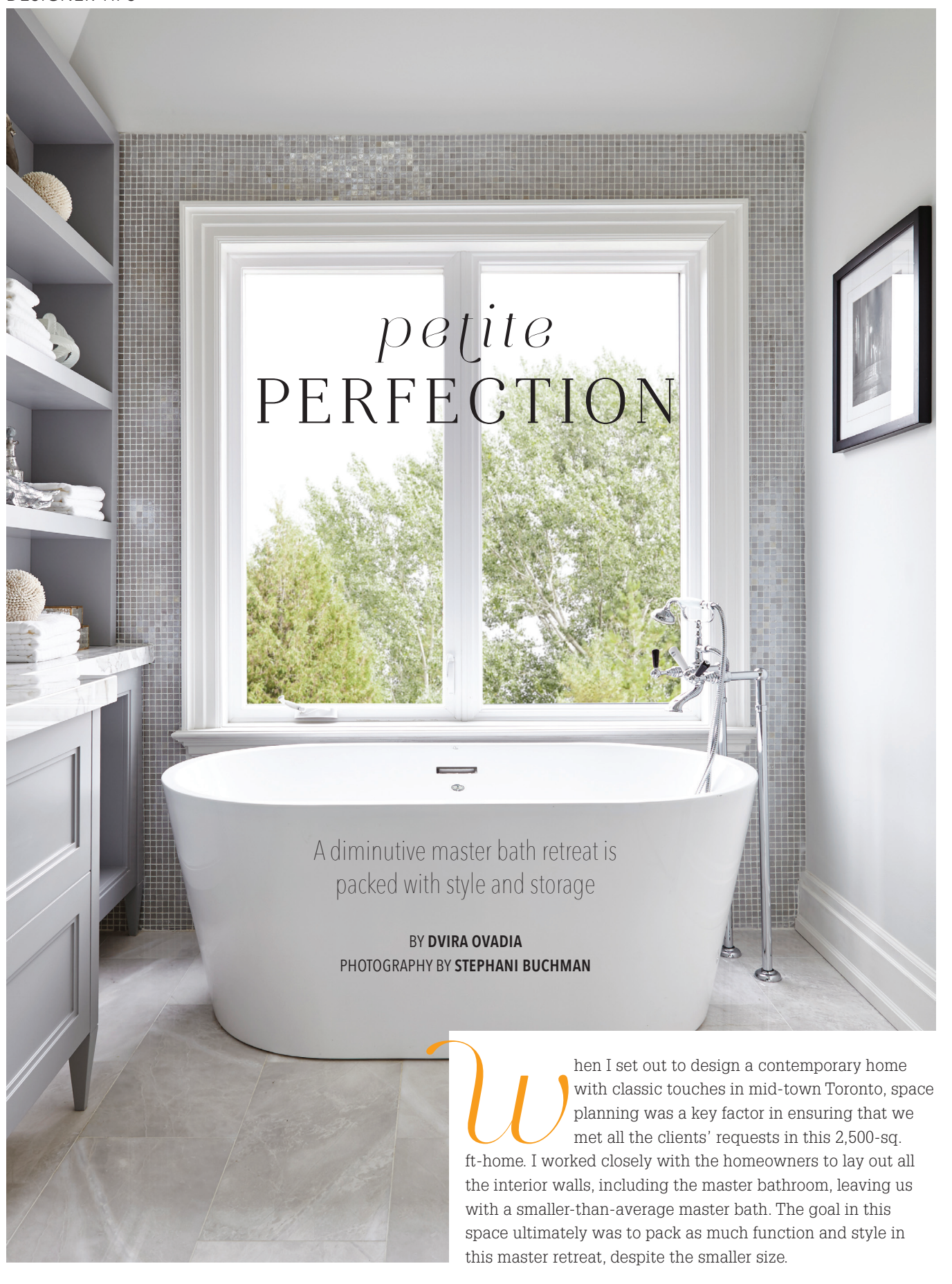
36 :: October/November 2017 RENO AND DECOR