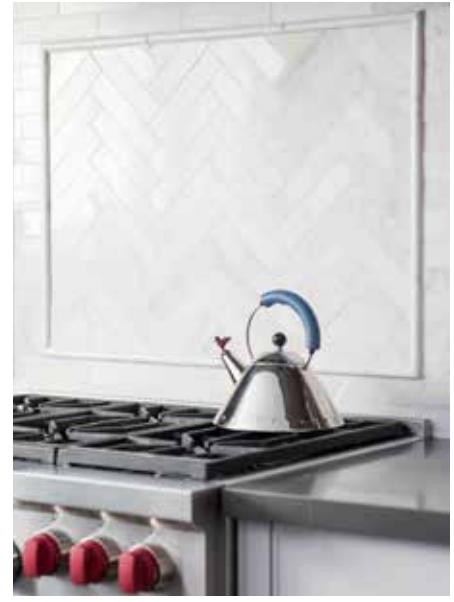
The natural marble backsplash is set in a herringbone pattern behind the stove to add some contrast.

The essentials and luxuries were compartmentalized in the 420-square-foot space by creating a serving area, a dramatic cooking zone with a monster hood, a spacious island, a bar area with its own sink and fridge, and enough cabinetry to house all the dishes and gadgets. With some innovative hinges,