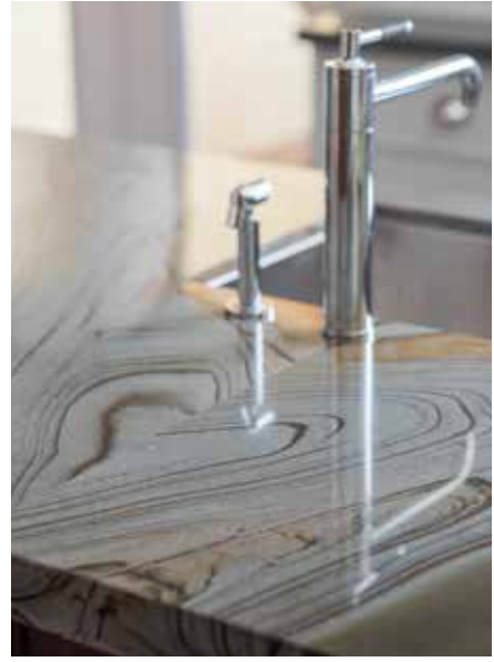
Bookmatching the Cascogne Verde stone creates a unique heart shape.

tial to the design of the kitchen, I created functional space with a built-in bar and seating. One of my favourite features is the bench. A casual piece of furniture in a kitchen brings an element of comfort and breaks up the monotonous look of chairs.