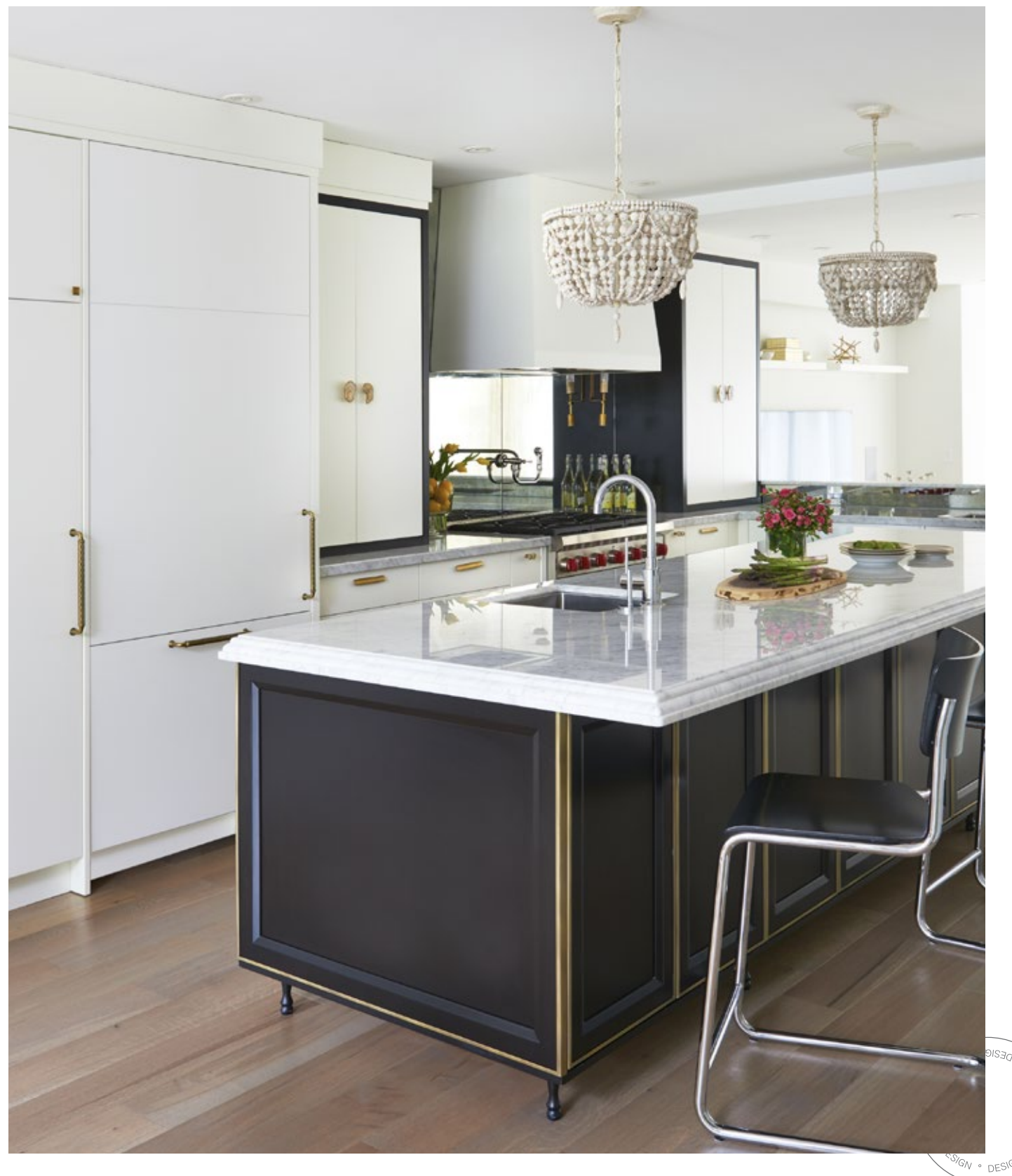
The 11-foot-long island can seat as many as seven people when Dvira entertains. "We cook here, we eat here and when we entertain I put out a big spread of food and everybody gathers here," she says. Gas stove: Wolf; panelled dishwasher and fridge, speed oven and bar fridge: Miele.

For drama, Dvira painted the cabinets in the 11-foot-long island jet black and added custom-made antiqued brass frames to each of the doors and to the gables. She lifted the two narrow ends onto slender legs that lend the appearance of a dresser even though there is enough space in the island to house a dishwasher, a bar fridge and a speed oven. Then she topped the island with lightly veined white Statuario marble, its edges heavily detailed.