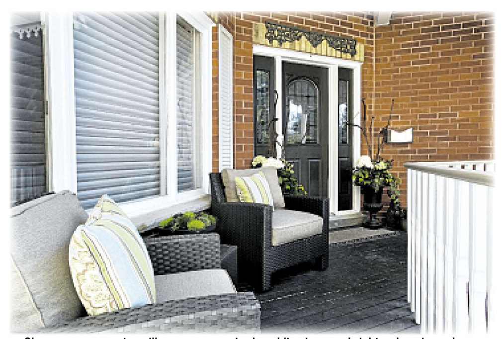
Change up your mat, mailbox or accessories by adding in some bright welcoming colours.