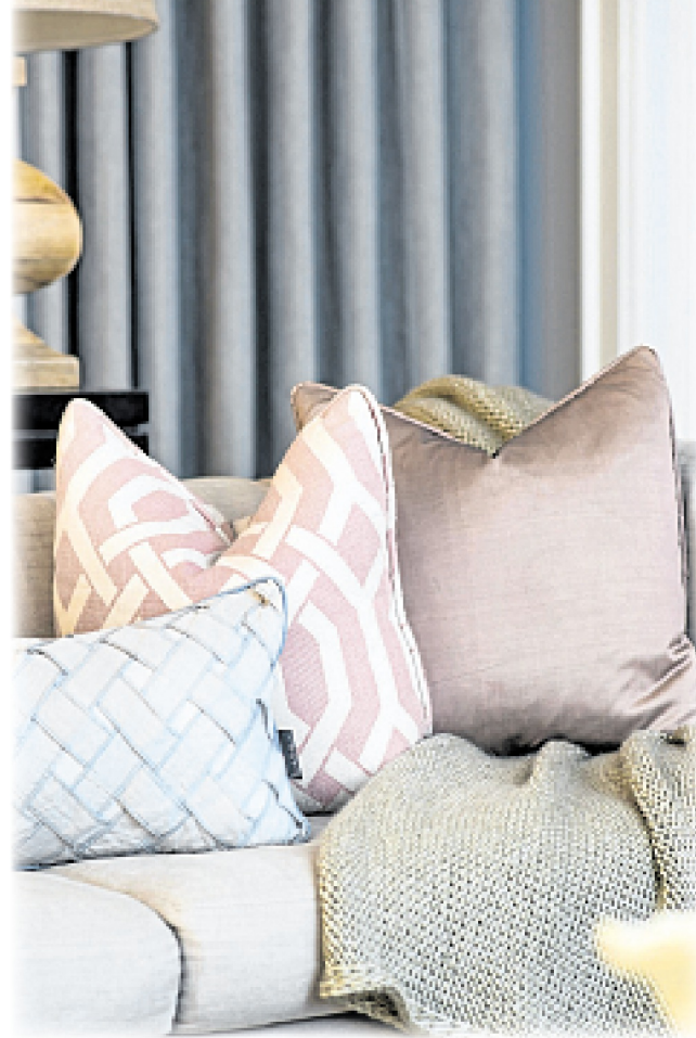
Change up your pillows, throws and area rugs to add in some vibrant colours.

a smooth and efficient project collaboration.