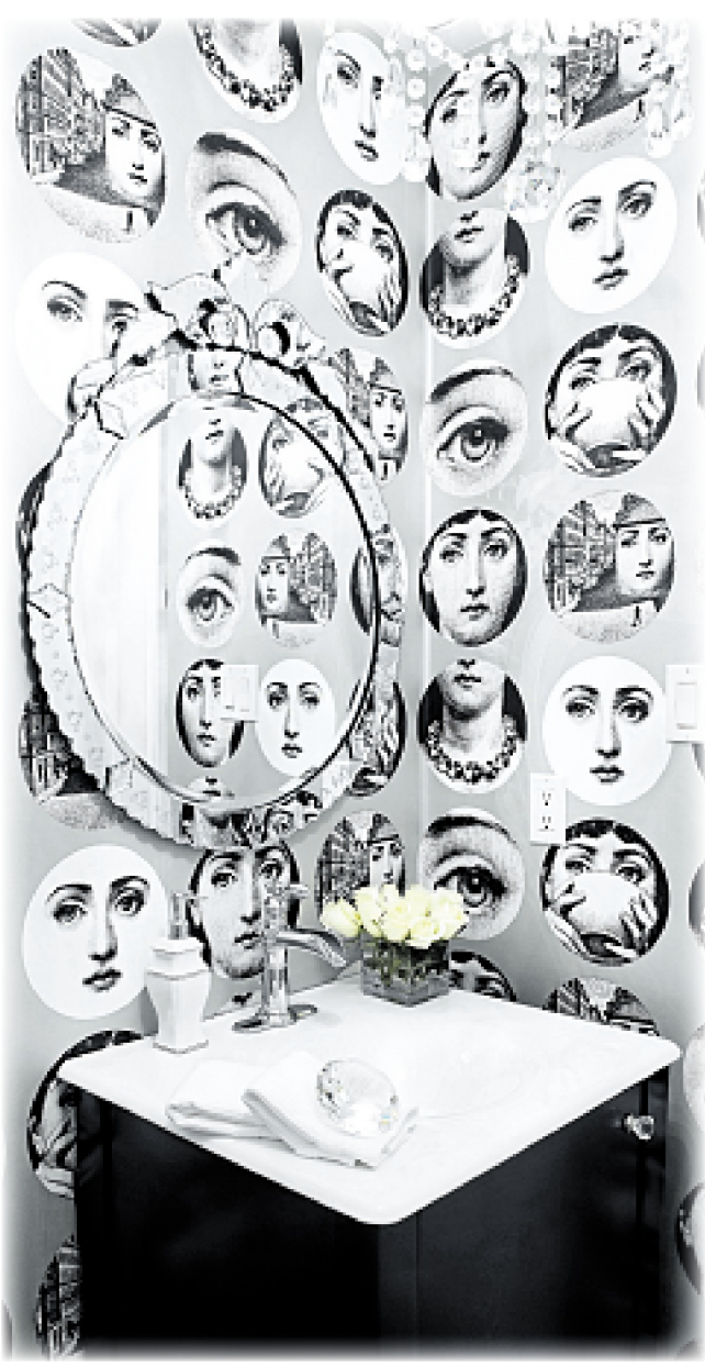
Wallpaper a feature wall in a living room, a bedroom or a bathroom and you won't believe the dramatic effect.

ours to plan your upcoming spring renovations. We find that our savvy clients make for